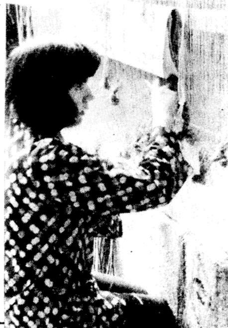
WOMAN CARPET MAKER

While talking to a group of girl students at the local secondary school it was apparent that none of them saw Killybegs as offering potential career opportunities. The majority, saw their future in Dublin or England, whether as college students or factory workers.