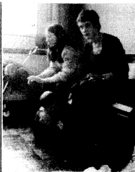
WHERE'S THE CRECHE

There is to be another conference later in the year - this time with a creche, when there will be more talking.