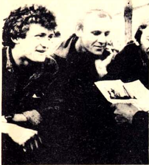
Workers in Gdansk discussing strike news.

Free Trade Unions Grow From Strength To Strength