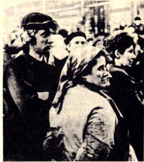
Meeting of striking workers in Lublin.

The Soviet Union has begun to brandish its war machinery in an effort to divide the opposition movement in Poland and to press the Polish bureaucracy towards further repression but it has not succeeded in intimidating Polish workers.