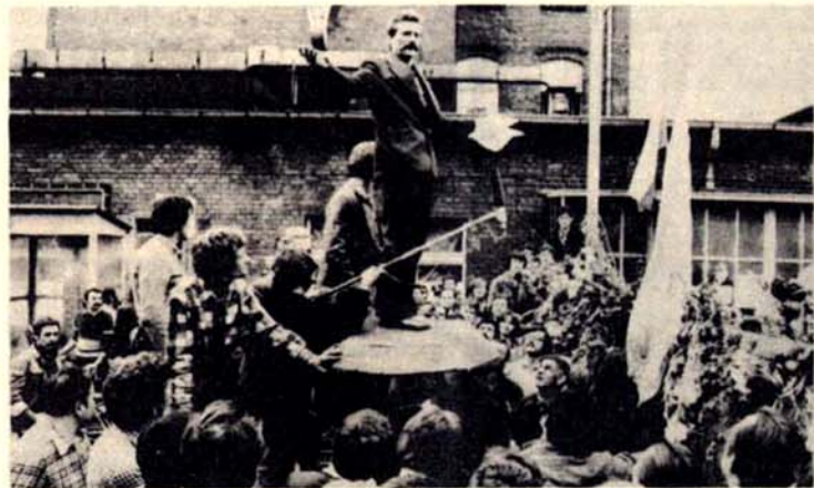
Polish trade union leader Lech Walesa speaking to workers in Gdansk.