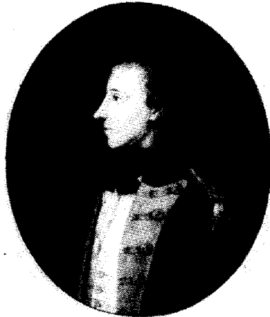
Theobald Wolfe Tone

We are children of Ireland, but we are also, as Irish Republicans " enfants de la patrie " because the school of Irish Republicanism is a Franco-Irish school and we have all been there. Liberty, Equality, Fraternity are noble ideals which still inspire us and for which we still struggle, both North and South of the British-created border.