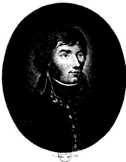
LE GÉNÉRAL HUMBERT

Síobadh neart an Airm Ghallda ina smionagar faoi gheit an attaque , scaipeadh i gcéin na blúirí éidreoracha mar a bheadh canach an fheocadáin lá gaoithe.