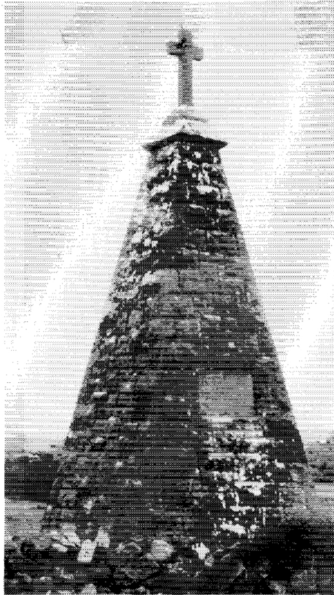
The French Hill monument outside Castlebar. The inscription reads: "In grateful remembrance of the gallant French soldiers who died fighting for the freedom of Ireland on the 27th August, 1798. They shall be remembered forever."