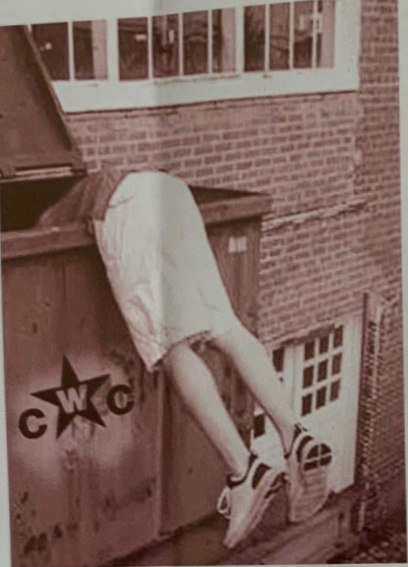
Despite much searching Siobhan could find no evidence of partnership being good for her

The average difference is £6.05 an hour for women and €3.43 an hour for men.