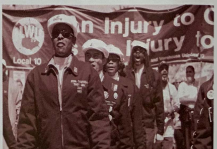
The union's drill team leads the San Francisco May Day march

As they wrote in a solidarity letter to ILWU members: "The courageous decision you made to carry out a strike on May Day to protest against the war and occupation of Iraq advances our struggle against occupation to bring a better future for us and for the rest of the world as well. We are certain that a better world will only be created by the workers and