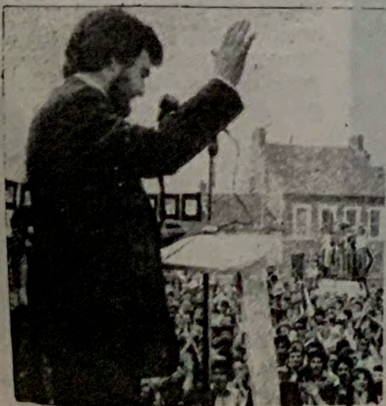
Owen Carron - banned by R.T.E.

I Mí Lunasa '77 thosaigh na coimheadóirí ag tabhairt iriseán do na cimi. Fuair siad "Our Boys" iriséan maith fá choinne an Gaeilge a fhoghlains ache nuair a fuair na coimheadóirí seo amach chur siad stad leo gan amhras. Nuair a bíonn na ranganna ar suil bíonn ar na suas chuig an doran, scairteann an múintoir amach an ceacht agus scríofhann na daltaí é ar an falla.