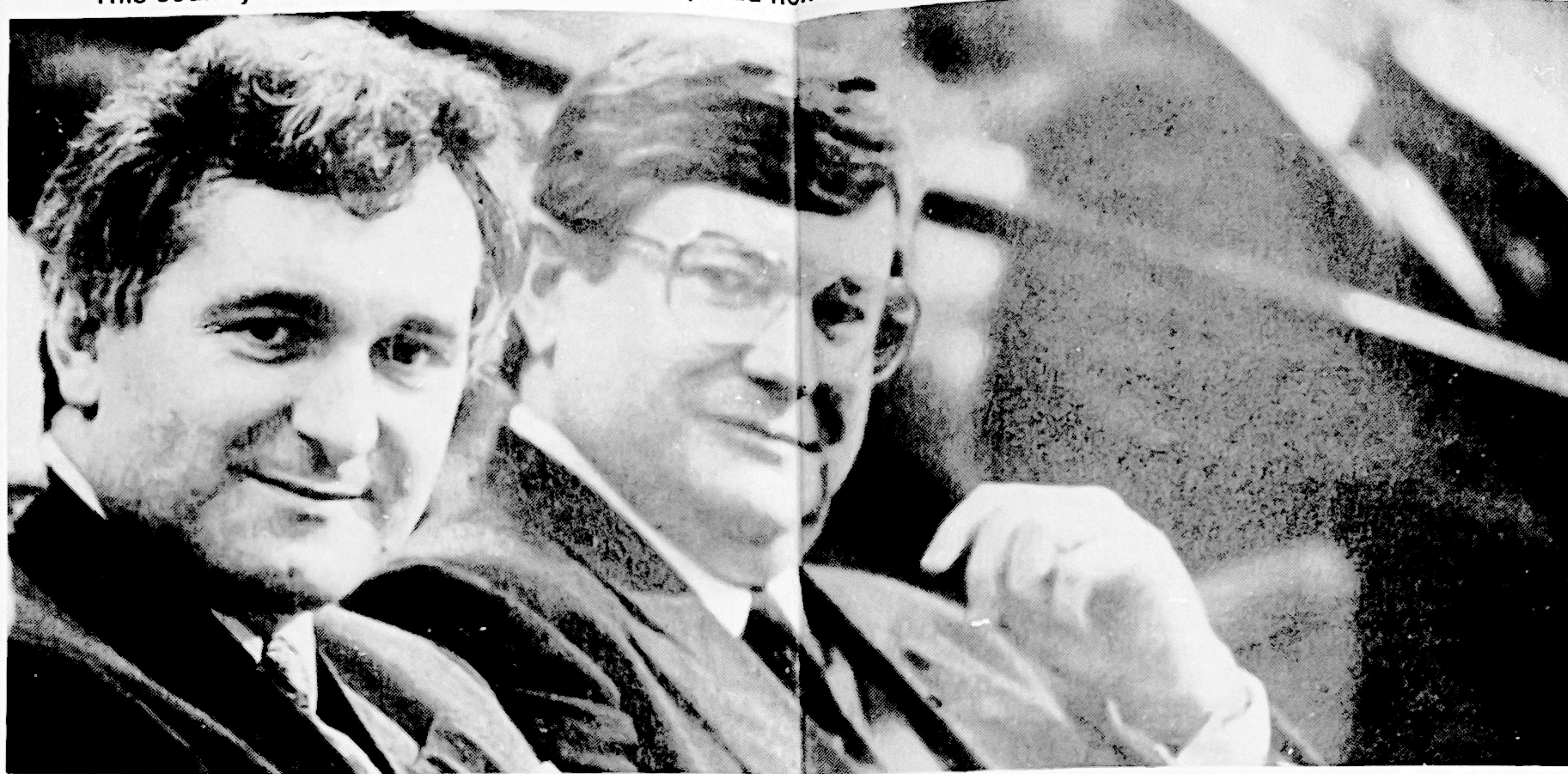
"a liar... evasive... a corrupt payment to him" - Justice Flood on Ray Burke

'This country owes him a debt of gratitude... a proud honourable man, loyal and true'. - Bertie Ahern on Ray Burke